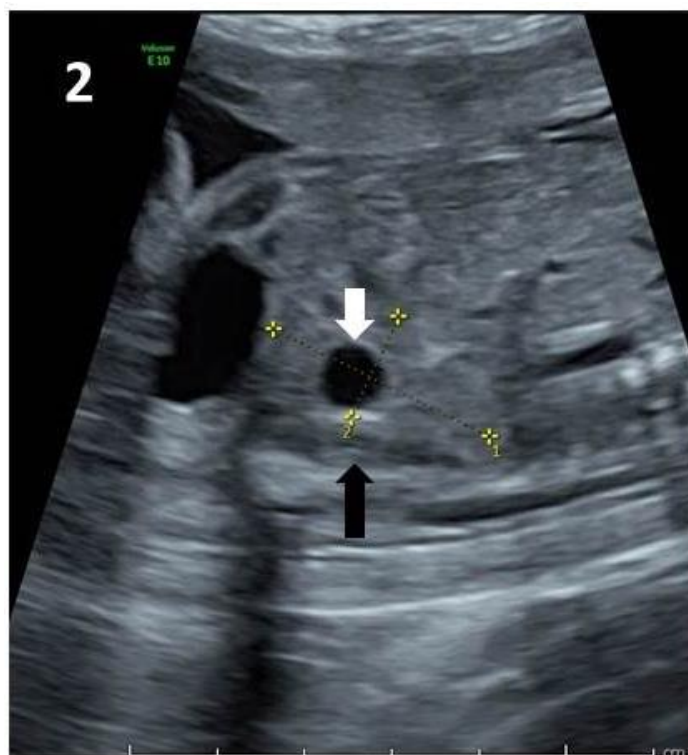
Figure 2 Pelvic kidney (black arrow) with renal cyst (white arrow).